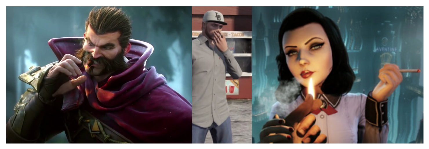
Many popular video games—including (left to right) "League of Legends," "Grand Theft Auto" and "Bioshock Infinite: Burial at Sea"— prominently feature characters smoking.

ruth Initiative and other partners in the public health community have worked together to raise awareness of "smoking in the movies" and the influence of tobacco imagery in films on youth audiences.