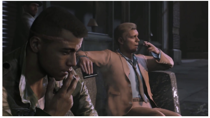
The "Mature"-rated game "Mafia 3" features many images of tobacco, including fictional tobacco product ads, throughout the game.

example of tobacco in a "Teen"-rated game can be found in "XCOM 2," in which characters fight against an alien invasion. The ESRB notes in its rating summary for the game that "players can customize soldiers with accessories, including lit cigarettes and cigars."<sup>14</sup> Overall, more than a dozen video games released so far this year include tobacco use, with at least five that are rated "Teen."