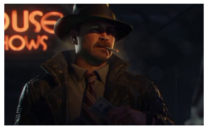
"Call of Duty: Black Ops III," part of the best-selling game franchise "Call of Duty," is rated "Mature," but many teens under 18 report playing it.

While other games with tobacco are rated "Mature" (content generally suitable for ages 17 and up), they are played by teenagers nationwide. In a survey of more than 9,000 youth and adults across the U.S., nearly 40 percent of gamers, aged 12 to 17, have played "Call of Duty: Black Ops," just one of several games in the "Call of Duty" franchise featuring smoking.<sup>15, 16</sup> In addition to "Call of Duty," best-