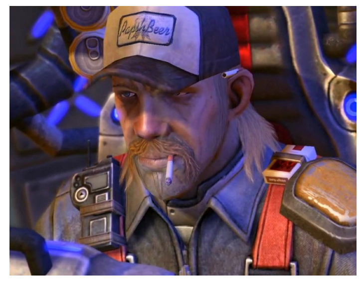
In the game "Starcraft II: Wings of Liberty," a battlefield game rated "Teen," three of the 13 soldiers that a player can select smoke.

We know that entertainment media has a strong influence on tobacco use. In its 2012 monograph on the role of media in tobacco use, the National Cancer Institute (NCI) found that, "media communications play a key role in shaping tobaccorelated knowledge, opinions, attitudes and behaviors among individuals and within communities."<sup>2</sup> The Centers for Disease Control and Prevention (CDC) notes that young people are "uniquely susceptible" to these types of influences given