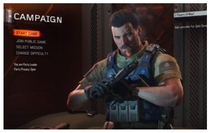
The main character in "Call of Duty: Black Ops III" cleans a gun while smoking a cigar.

Third, unlike when people watch movies and merely observe tobacco being used, many games feature playable characters who smoke—simulating and rewarding smoking behavior for the player. In "Grand Theft Auto Online," players can purchase a pack of cigarettes in the game and have their character smoke them.<sup>22,23</sup> In some games, players cannot even control whether their characters use tobacco. In "Call of Duty: Black Ops III," released in November 2015, before the player even starts the game, the first interaction with the protagonist is to watch him or her smoke a cigar while cleaning a gun.<sup>24</sup>