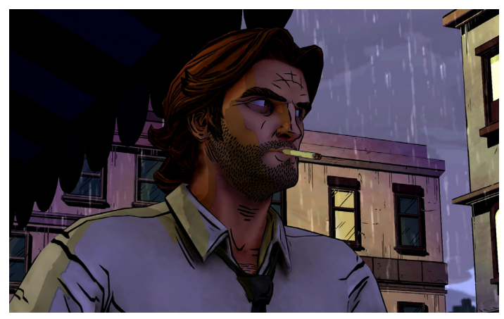
The ESRB rating summary for "The Wolf Among Us," rated "Mature," states that the "central character is persistently depicted smoking cigarettes, and some sequences allow players to control whether to share these cigarettes with others."

We also need to learn more about the relationship between playing video games and smoking, particularly among U.S. adolescents. A 2015 survey found that 26 percent of males and 22 percent of females between the ages of 18 to 24 who play games, also bought cigarettes, but we do not know if or how their smoking behavior is influenced by the games they play.<sup>29</sup> While some studies have found a correlation between video game playing and tobacco use, the results are not consistent across studies.<sup>30, 31</sup> A recent online survey of adults found video game playing to be more prevalent among smokers, and it also found that smokers reported playing video games more recently and for longer durations.<sup>32</sup> A study of Dutch secondary school students found that boys who used marijuana, tobacco and alcohol were nearly twice as likely to report problematic (i.e., excessive or addictive) video gaming, but did not find a relationship between non-problematic game playing and smoking.<sup>33</sup> A 2011 study of adolescents in California also had mixed results, with video game playing on weekdays positively correlated with tobacco use, but video game playing on weekends negatively correlated.<sup>34</sup> Two other studies found no relationship between tobacco and video game use.<sup>35, 36</sup>